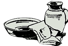
The towel and basin