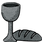
The Lord's Supper